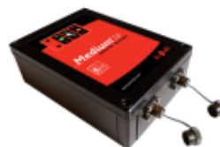
1 BOX antenna