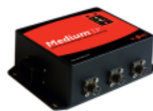
1 Control unit