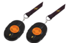
2 Worker badges